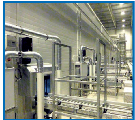
Hypoxic air fire prevention