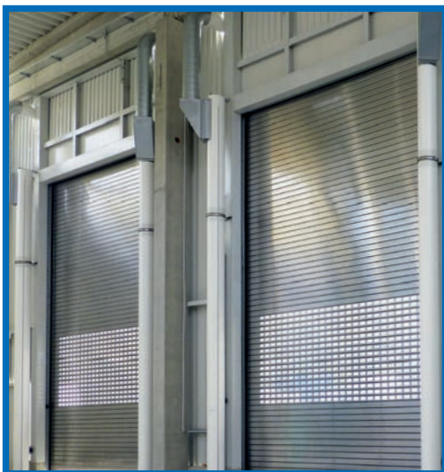
Pollution protection: recycling depot