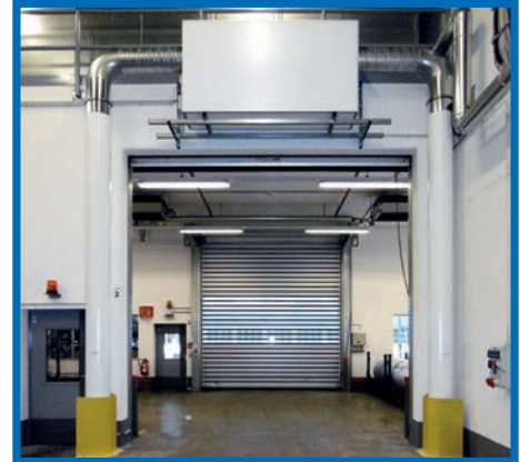
Industrial door: insect protection

Depending on application, two precisely-orientated vertical arwus diffusers, standing left / right of entrance, ensure optimally directed air distribution. The resultant planar airstreams get deflected to form a dam in the middle of the passage, halting the transfer of pure or impure substances.